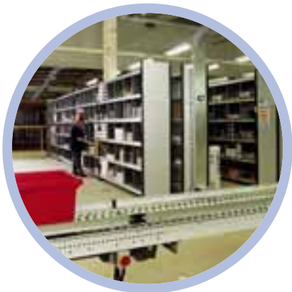
HEAVY DUTY SHELVING