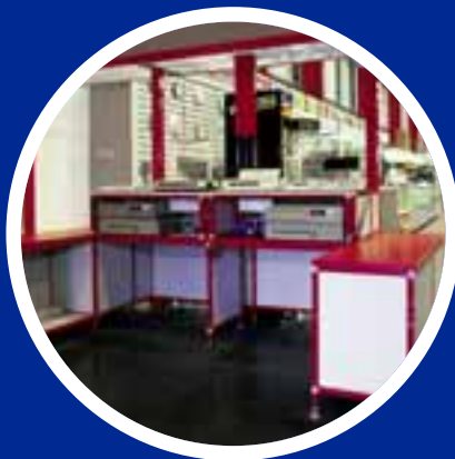
ANGLE AND SQUARE TUBE CONSTRUCTION SYSTEMS