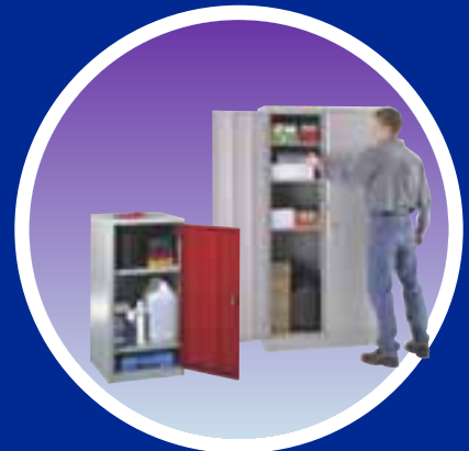
COMMERCIAL AND WORKPLACE EQUIPMENT