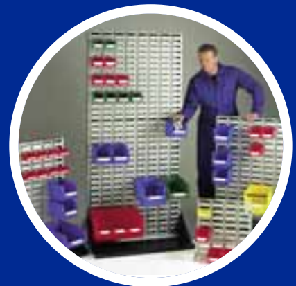
SMALL PARTS STORAGE